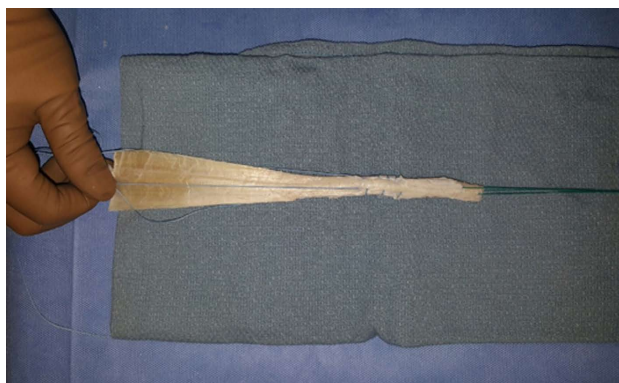
Figure 1 Non-irradiated Achilles allograft tissue. A non-irradiated Achilles tendon allograft used in an anterior cruciate ligament reconstruction procedure.

the catastrophic failure rate and functional outcomes in patients after ACL reconstruction with allograft tissue.