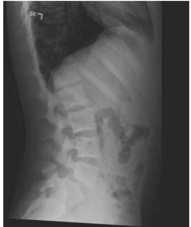
FIGURE 3. Lateral radiographs of the lumbar spine demonstrates L5 bilateral spondylolysis and grade I spondylolisthesis at the L5 to S1 level.