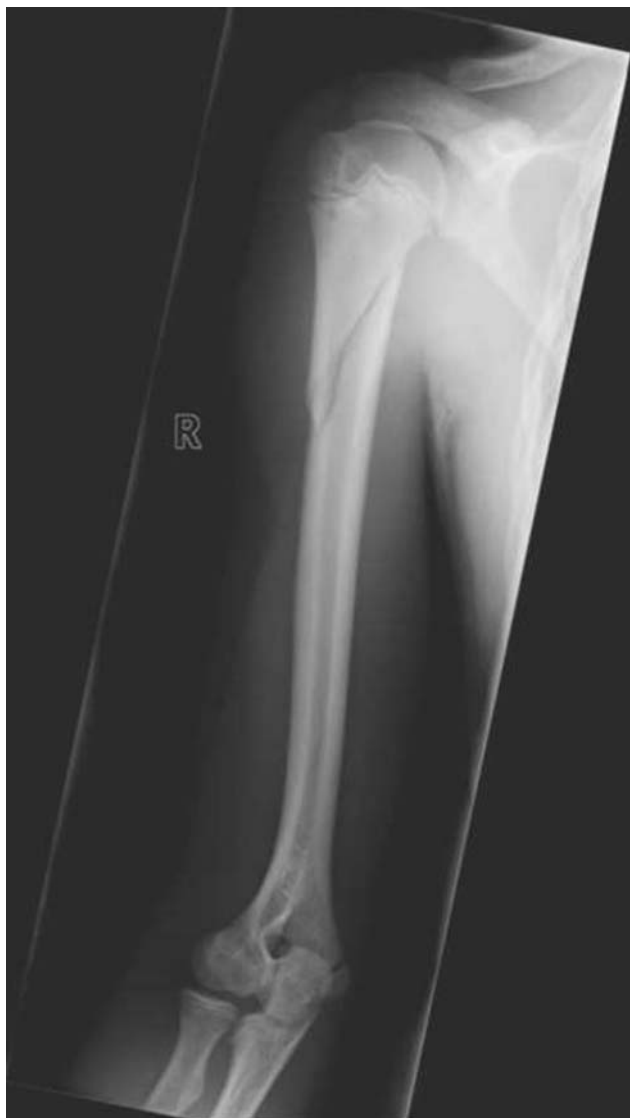
FIGURE 1. Anteroposterior view of the right humerus showing a minimally displaced oblique fracture.

displaced oblique right proximal humerus fracture without evidence of any underlying metabolic disorder (Fig. 1). The patient was treated with a sling and nonweight-bearing instructions. At 1-month follow-up, repeat radiographs demonstrated healing of the fracture with callus formation. At 3 months, the patient reported no pain in the right upper extremity during both active and passive range of motion. He was subsequently able to return to baseball and pitching without further difficulties or complaints.