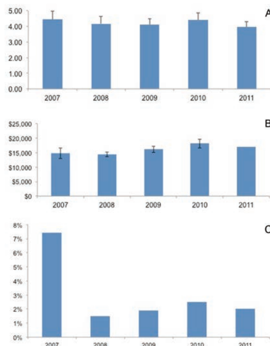
Figure 2. Average length of stay (A), cost (B) and complication rates (C) of total elbow arthroplasty patients in the United States.