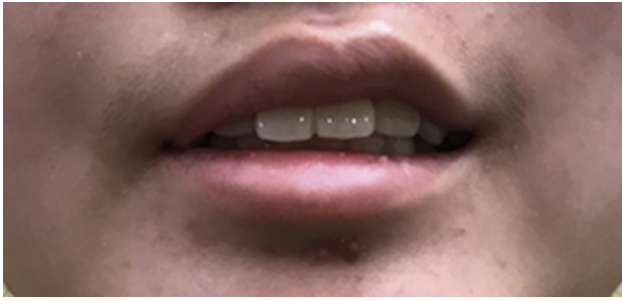
Figure 3 Inability to purse the lips or raise the right corner of the mouth.

asymmetry have remained unchanged. The patient and her family continue to desire nonoperative management and have inquired about developing custom braces to support both her hand and shoulder function. Given her genetic diagnosis of FSHD, she has also been referred to the neurology department for continued management and follow-up. The complexity of presentation, diagnosis, and management of FSHD emphasizes the necessity of a collaborative multidisciplinary team approach to maximize patient satisfaction and outcomes.