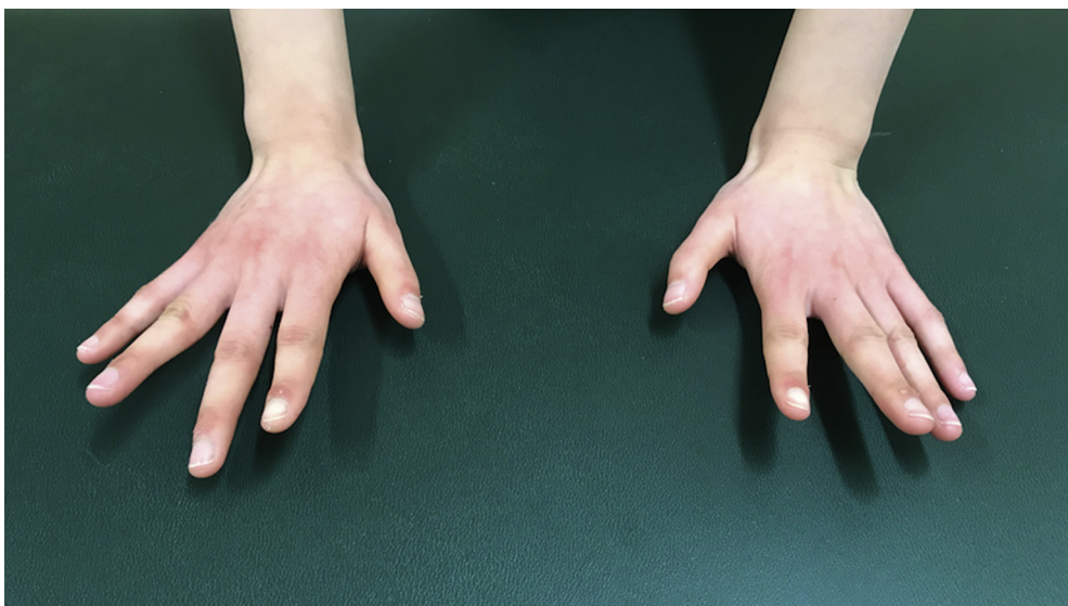
Figure 2 30° extensor lag of the right long finger.

At 1 year, despite regular occupational therapy, the patient continues to experience difficulty with her upper extremity function during activities of daily living. Her scoliosis and facial