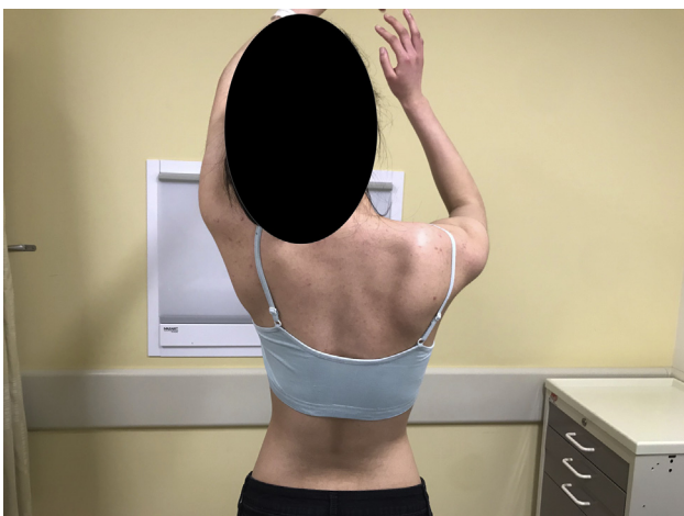
Figure 4 Decreased forward flexion and profound scapular winging.

This case demonstrates an uncommon presentation and the unique development of a subspecialty team approach to aid in diagnosis and management of a rare genetic condition. Given the multitude of concomitant physical manifestations of FSHD, it was necessary to develop a comprehensive collaborative team to optimize diagnostic accuracy and outcome. According to the robust UK FSHD registry, the most prevalent symptom at onset is that of facial weakness or asymmetry representing nearly 60% of cases. This is closely followed by shoulder-girdle deficiency at 53%. 11 Furthermore, FSHD is known to be an elusive diagnosis with exact prevalence prone to underestimation as the disease is characterized by a high degree of clinical variability with a large proportion of individuals having only mild symptoms. 8 As such, our patient demonstrated a unique diagnostic challenge presenting to the orthopedic hand clinic with mild nonspecific complaints of increasing difficulty playing the piano and typing on her computer secondary to isolated long finger weakness and dysfunction. Only on careful collaborative consultation with a dual fellowship-trained sports