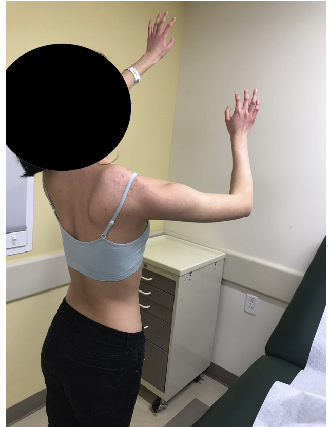
Figure 5 Decreased forward flexion and profound scapular winging.

medicine and shoulder surgeon was the clinical diagnosis of FSHD determined. Her exaggerated lumbar lordosis was promptly discovered only after FSHD became the predominant diagnosis. Her manifestation of increased lordosis was further associated with decreased lower abdominal muscular tone as is commonly found in patients with FSHD. Although our patient did not exhibit Camptocormia (bent spine syndrome), this particular spinal association begs mentioning as it represents a rare phenotypic presentation of FSHD. 19 Therefore, further evaluation by an orthopedic spine surgeon was appropriate to characterize the type and degree of spinal deformity and to determine treatment in the context of FSHD.