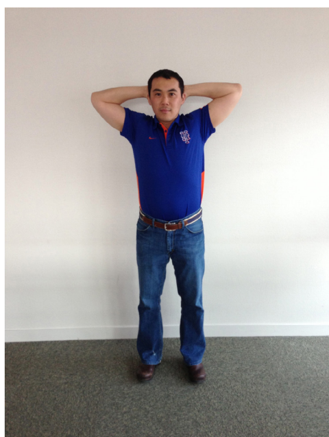
Figure 10: Both hands behind the head to maximize external rotation.

can be safely initiated without pain and in proper form. Attempts to strengthen a stiff shoulder can cause pain, subacromial impingement, and excessive stress on the repair. Only when shoulder mobility or range of motion is maximized are advanced strengthening exercises permitted to increase muscular load. It is important avoid any overhead activity that will result in subacromial contact to occur. Such contact will only exacerbate impingement or stress the repair. Thus, initial exercising of the internal and external rotators should be performed with the arm below the level of the shoulder.