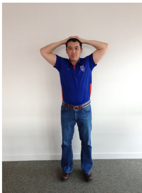
Figure 8: Hand on the top of head with active assistance from the normal contra-lateral arm.