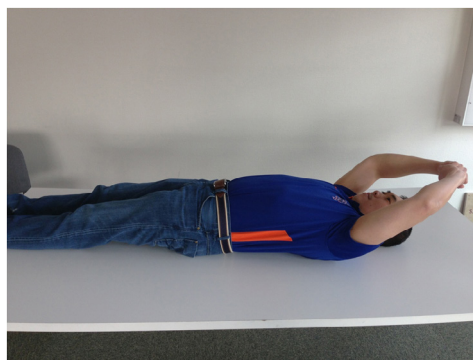
Figure 7: Supine active assisted forward flexion exercise done with the help of the contra-lateral normal arm. Range of motion as tolerated and limited by pain.

The strengthening phase should begin approximately 10 to 12 weeks postoperatively depending on the size of the tear, surgical fixation, and patient factors. Histologically, the remodeling phase is nearly complete, with tendon-to bone healing generally strong enough to allow for a graduated program of muscle strengthening. Importantly, both glenohumeral and scapulothoracic kinematics, as well as soft-tissue compliance, should be optimized so that a strengthening program