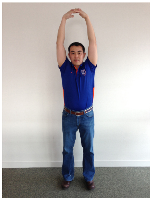
Figure 9: Elbows extending to maximize flexion.