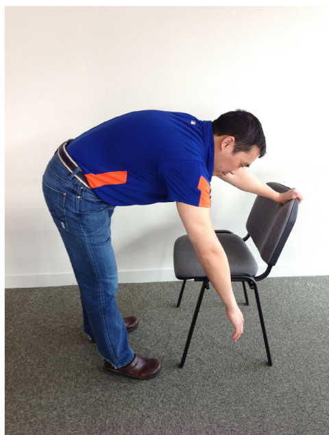
Figure 5: Pendulum exercises performed by leaning your body with the support of a chair and have your arm dangle in front of your body. Both clockwise and counter clockwise motion is performed.