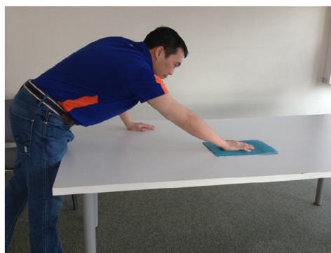
Figure 4: Table slide is performed with the patient leaning over a table and sliding the operative extremity on a piece of paper or a book on a table. Range of motion as tolerated, however it should be limited based on pain.