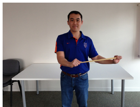
Figure 6: External and internal range of motion with the assistance of a hand wand, stick, or a cane. This exercise should be performed in the plane of the scapula.

The use of pulleys, canes, active assisted ROM (AAROM), and self-assisted ROM however are appropriate at this point. A pillow or towel roll may be used under the arm to help alleviate passive tension across the rotator cuff. This is slowly graduated to full active ROM. It is still advisable to avoid resistance work because tendon-to-bone healing strength at this time point is inadequate to withstand the forces generated during strengthening exercises. An example of AAROM includes supine glenohumeral external and internal rotation with stick assistance, as well as supine flexion with the assistance of the uninvolved limb (Figure 7). An alternative AAROM technique is