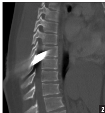
Figure 2: Sagittal computed tomography scan showing the knife blade in the middle aspect of the thoracic spinal cord.