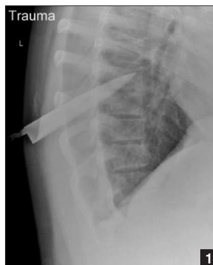
Figure 1: Lateral thoracic spine radiograph showing the knife blade extending from the T8 lamina superiorly into the T7 vertebral body.

Postoperative examination revealed that the patient had full strength and sensation to light touch in the upper and lower extremities bilaterally. Reflexes were 2+ and symmetrical throughout with negative Babinski, clonus, and Hoffman signs. At discharge, the patient was able to ambulate with the assistance of crutches and demonstrated normal bowel and bladder function.