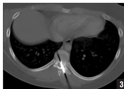
Figure 3: Axial computed tomography scan confirming the central location of the knife blade in the thoracic spinal cord with track extending past the T7 vertebral body.