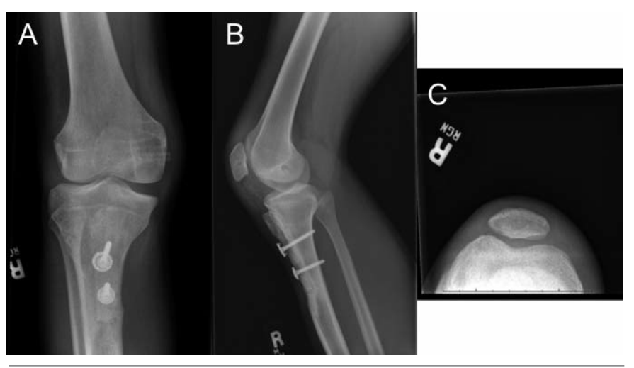
Figure 5. AP (A), lateral (B), and Merchant (C) radiographic views of the knee at the 1 year follow-up visit. The patella is anatomically located in the trochlea groove with union of the distal tibial tubercle osteotomy site.

motion is started post-operatively to prevent stiffness and patients are allowed to weightbear as tolerated in a knee immobilizer until knee motion and quadriceps function has returned to normal.<sup>7,14</sup> Long-term follow-up of MPFL reconstruction demonstrates satisfactory results in the majority of patients. Nomura et al.15 evaluated 24 knees from 22 patients after MPFL reconstruction with a mean followup of 11.9 years and found 88% of patients had excellent/good outcomes according to the Crosby/Insall criteria. Twelve percent of patients had fair/poor outcomes and no patients were worse at follow-up. Anteromedial tibial tubercle transfer is the procedure of choice for patella instability with a TT-TG distance of >20 mm and patella articular degeneration (lateral and distal facet) caused by mal-alignment. The osteotomy plane is deep to the tibial tubercle, and should be fairly steep to allow for 12-15 mm of anteriorization of the tubercle, which will help unload the patella. Balancing the amount of anteriorization versus medialization can be done by changing the slope of the osteotomy. Fulkerson et al.9 reported 93% excellent/good results subjectively at two-year follow up and 89% excellent/good results objectively using the knee instability scale.