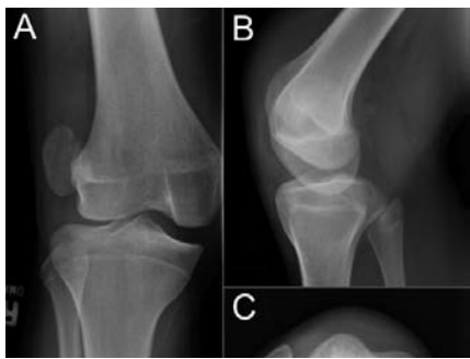
Figure 2. AP (A), lateral (B) and Merchant (C) radiographic views of the patella demonstrates the patella dislocated in the lateral gutter. On the Merchant view (C), femoral trochlea dysplasia is not seen. This was further confirmed intraoperatively.